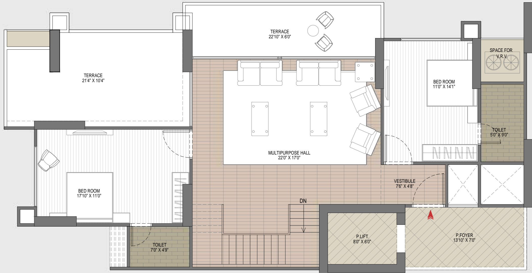
4BHK Duplex Penthouse - Upper Level 4557 Sq. Ft. (SBA) + 335 Sq. Ft. Terrace (Carpet)

Disclaimer: This drawing and the design/data therein are the property of MANSI SHAH ARCHITECTS. They are merely loaned and will neither be reproduced, copied, loaned, exhibited nor used except in the limited way and private use as permitted by any written consent given by MANSI SHAH ARCHITECTS.