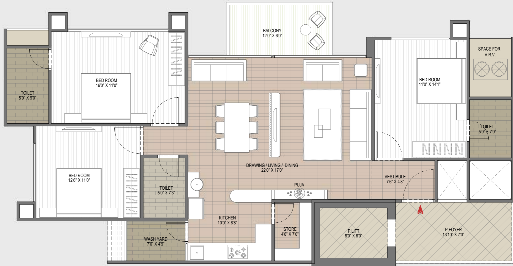
3BHK - 2490 Sq. Ft. (SBA) (A, C, D)