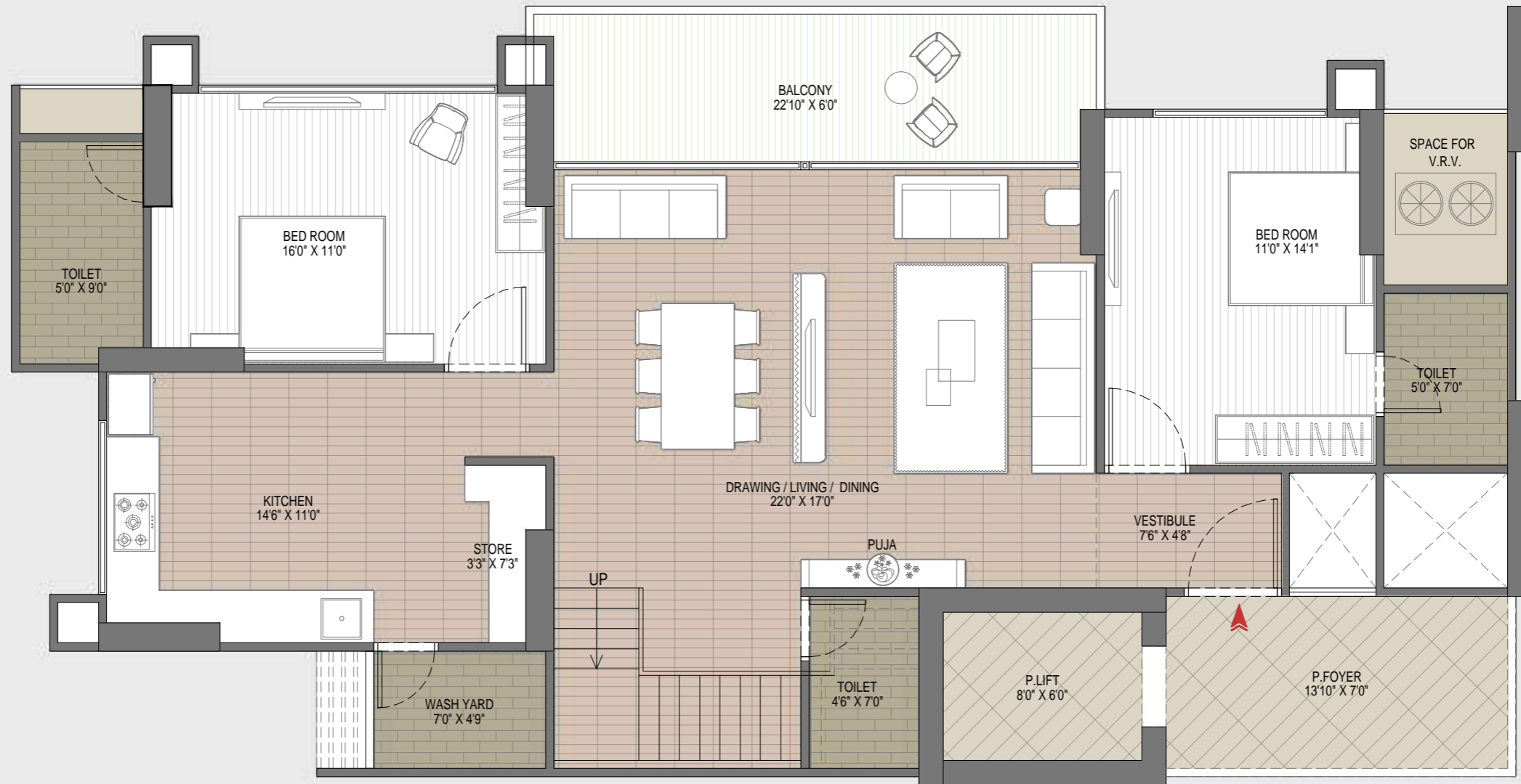
4BHK Duplex Penthouse - Lower Level 4557 Sq. Ft. (SBA) + 335 Sq. Ft. Terrace (Carpet)

Disclaimer: This drawing and the design/data therein are the property of MANSI SHAH ARCHITECTS. They are merely loaned and will neither be reproduced, copied, loaned, exhibited nor used except in the limited way and private use as permitted by any written consent given by MANSI SHAH ARCHITECTS.