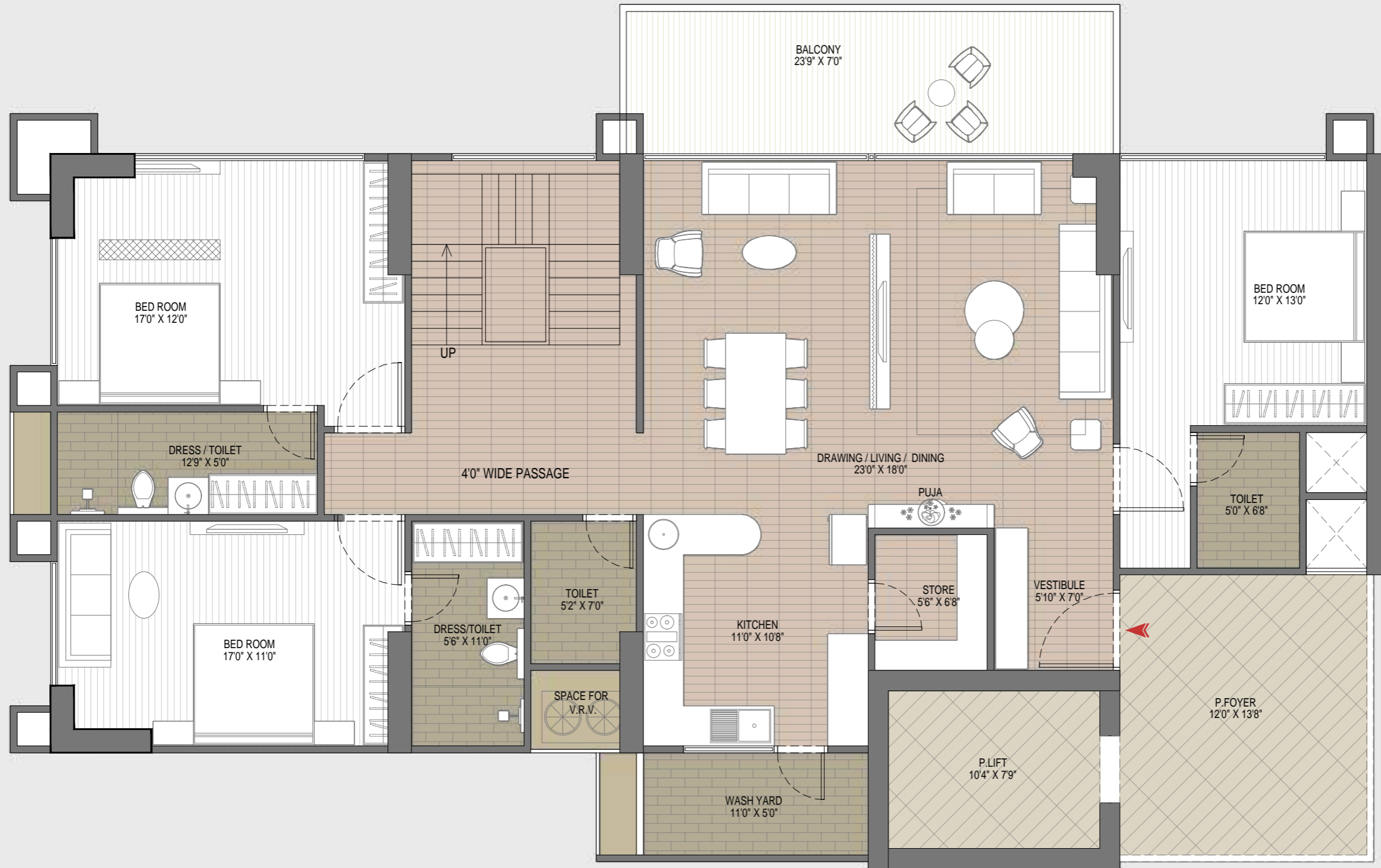
5BHK Duplex Penthouse - Lower Level 6095 Sq. Ft. (SBA) + 630 Sq. Ft. Terrace (Carpet)

Disclaimer: This drawing and the design data therein are the property of MANSI SHAH ARCHITECTS. They are merely based and will neither be reproduced, copied, loaned, exhibited nor used except in the limited way and private use as permitted by any written consent given by MANSI SHAH ARCHITECTS.