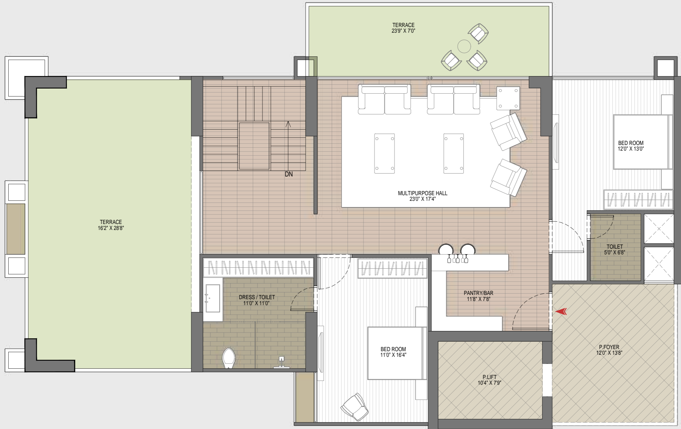
5BHK Duplex Penthouse - Upper Level 6095 Sq. Ft. (SBA) + 630 Sq. Ft. Terrace (Carpet)

Disclaimer: This drawing and the design/data therein are the property of MANSI SHAH ARCHITECTS. They are merely loaned and will neither be reproduced, copied, loaned, exhibited nor used except in the limited way and private use as permitted by any written consent given by MANSI SHAH ARCHITECTS.