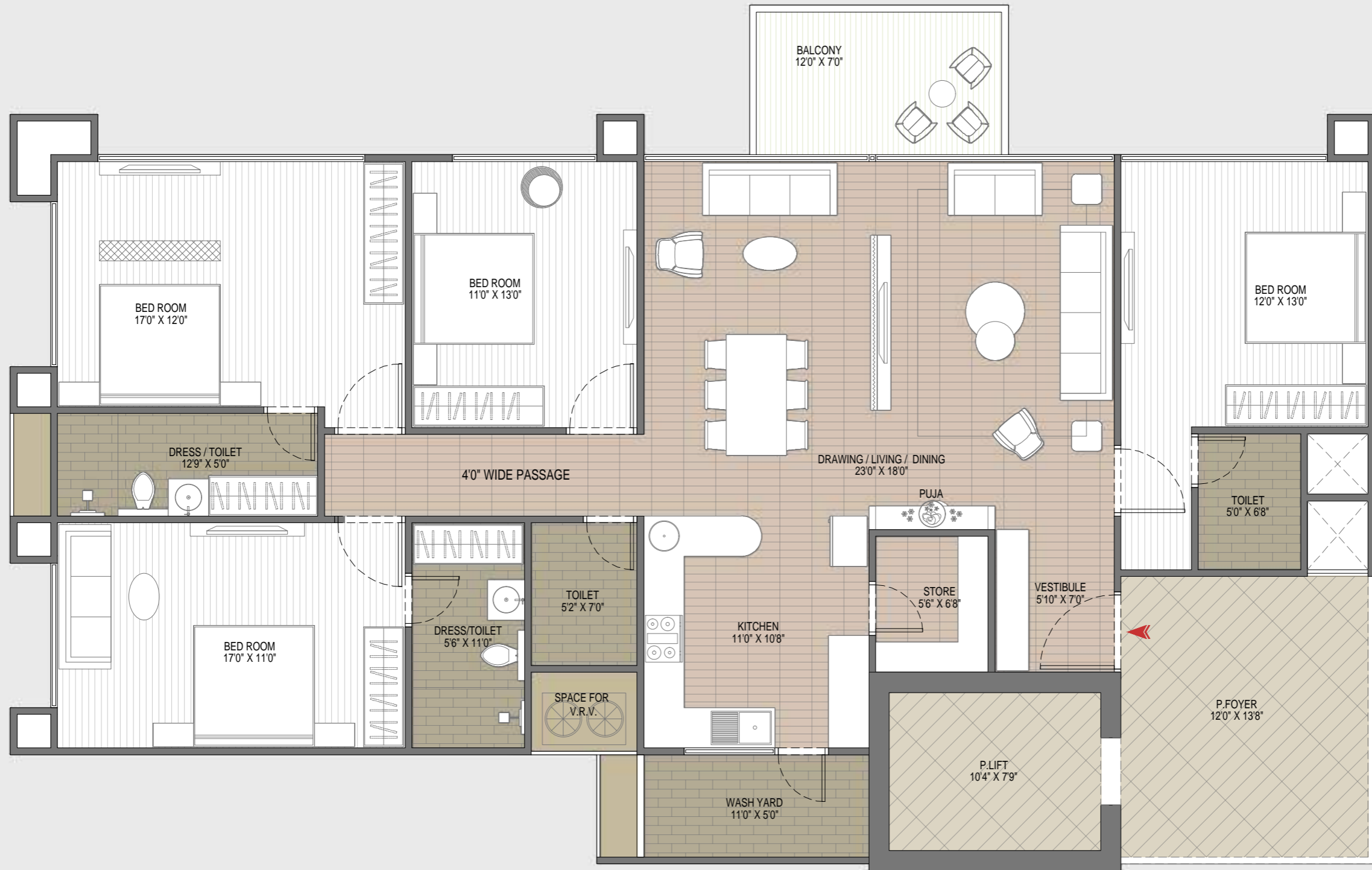
4BHK - 3490 Sq. Ft. (SBA) (B & E)

Disclaimer: This drawing and the design/data therein are the property of MANSI SHAH ARCHITECTS. They are merely loaned and will neither be reproduced, copied, loaned, exhibited nor used except in the limited way and private use as permitted by any written consent given by MANSI SHAH ARCHITECTS to the client.